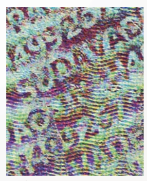
IPI (Invisible Personal Information)