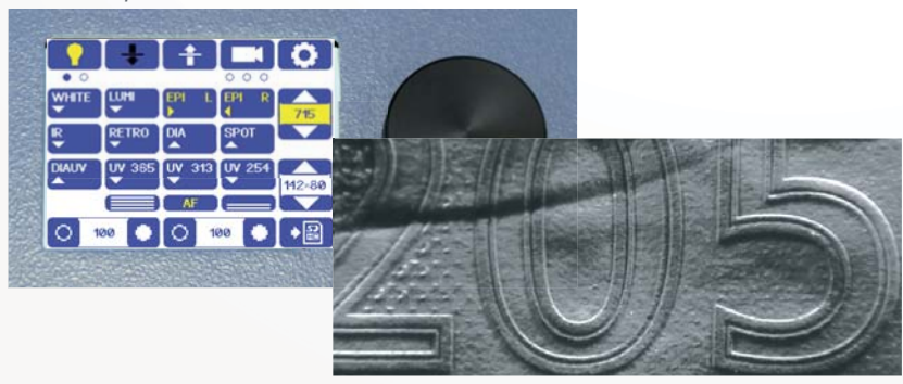
Intaglio printing in IR absorption

Touchscreen and jogger knob for simple and intuitive operation.