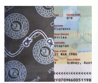
Verification of retroreflective security elements