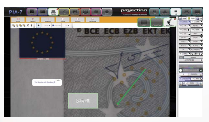
Measuring of distances, angles, circle diameters and annotations of text and marks