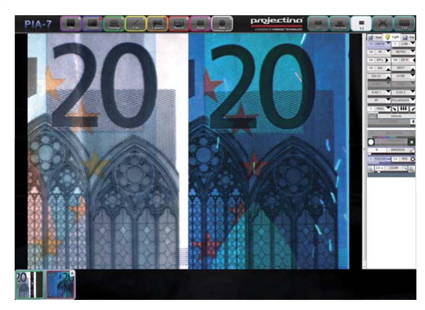
Horizontal or vertical split comparisons